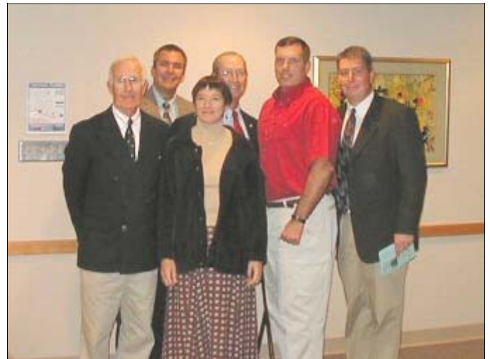
2004 BVYC Board of Directors: