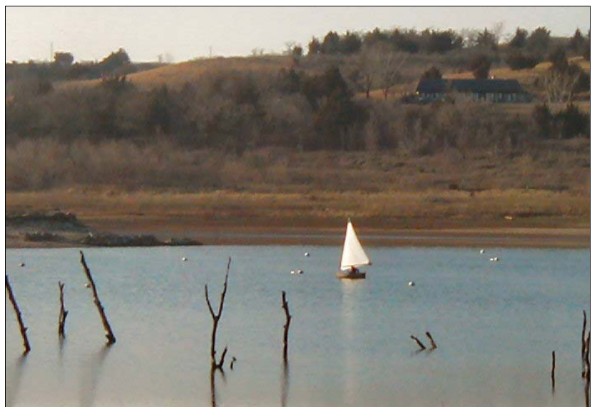
Photo of BVYC sailor taken when there was still lots of winter in the air and water. Who is this sailor?