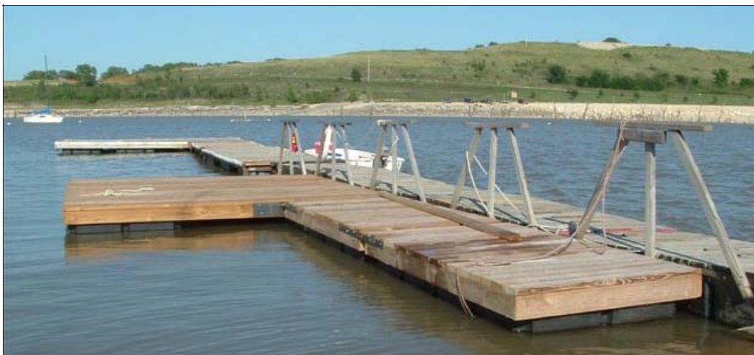
Reconstructed dock soon to be emplaced for use by dinghy sailors