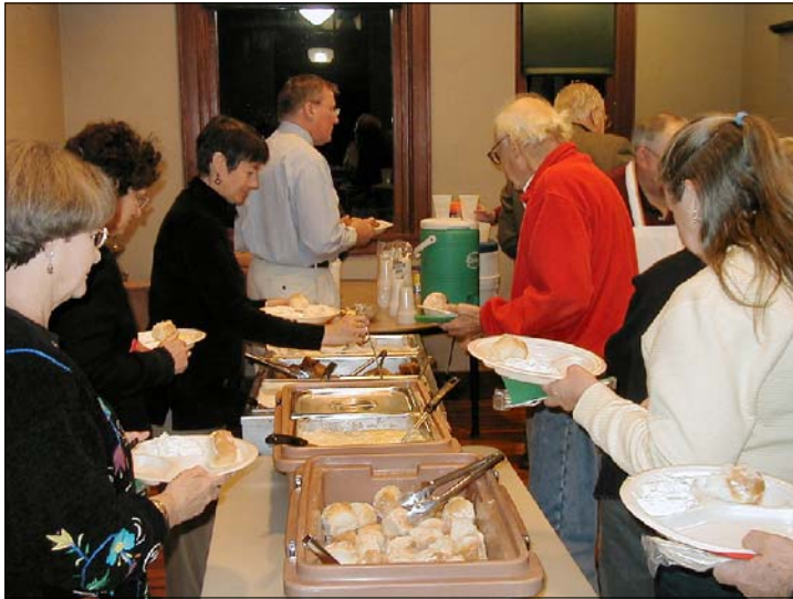
Above, Food a-plenty for hungry sailors and guests

There are many additional photographs on the Club website: www.bluevalleyvachtclub.org