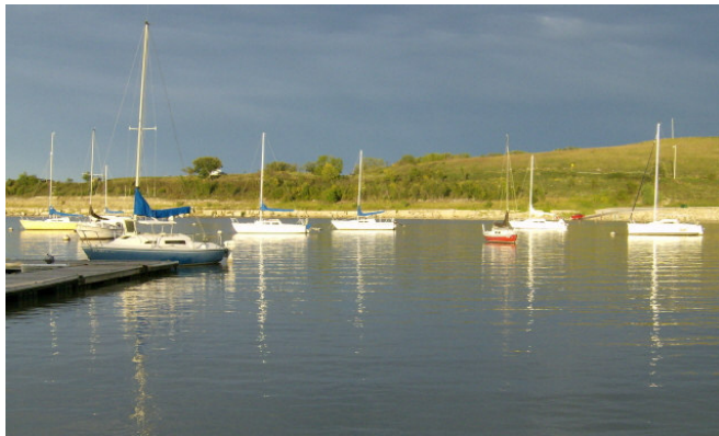
Shadows get longer as sunlight fades over the harbor.