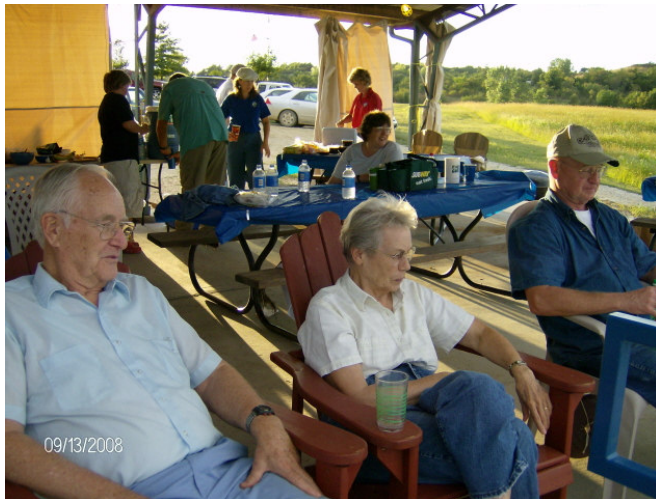
Members sit and visit following the Fall Hog Roast. Curtains installed earlier in the day provide welcome shade.